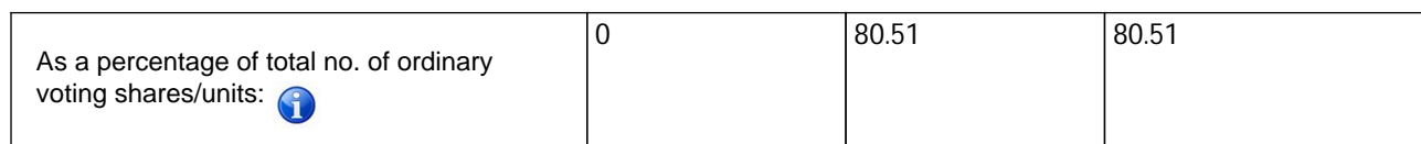
Table 3. Change in respect of rights/options/warrants over shares/units of Listed Issuer